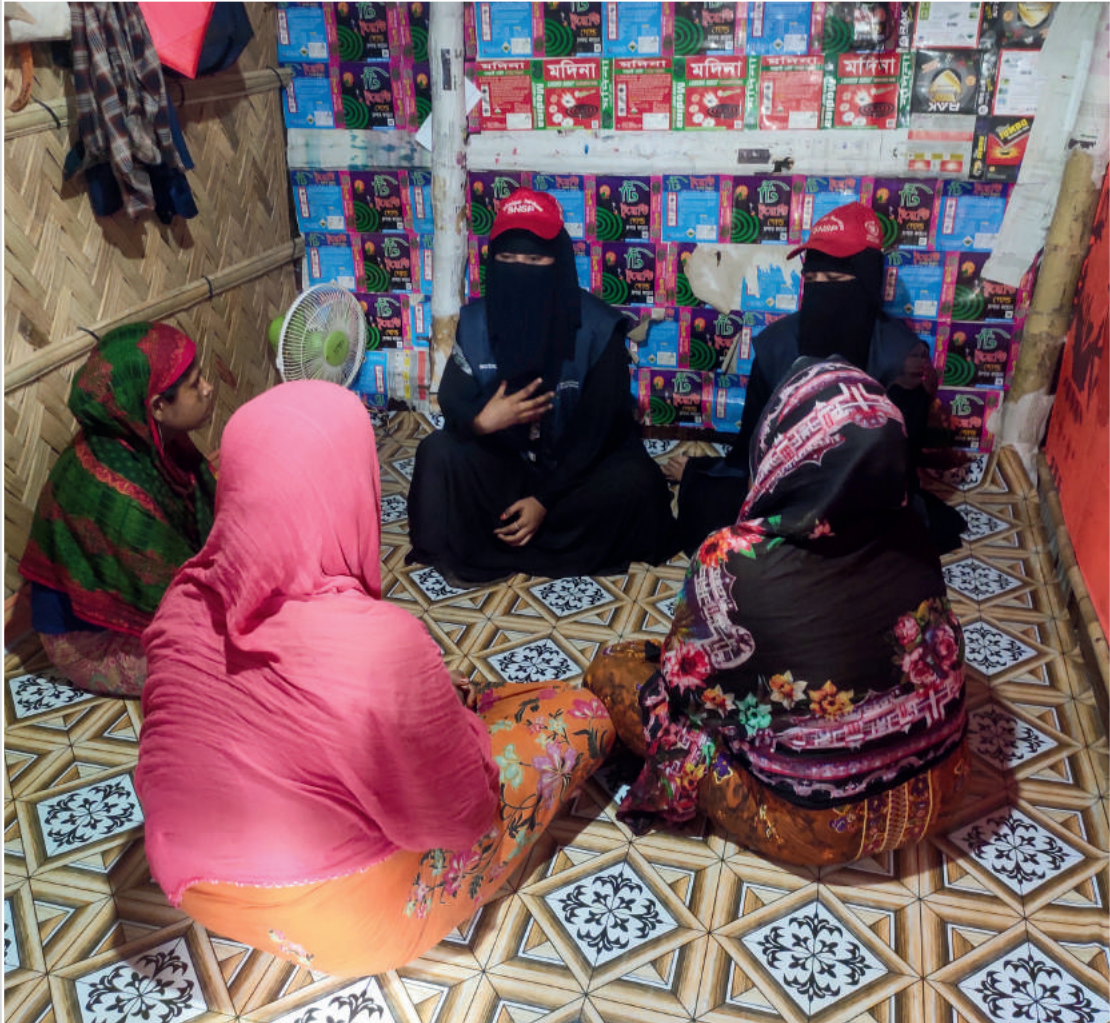
Engaging in gender champions' activities within the camp