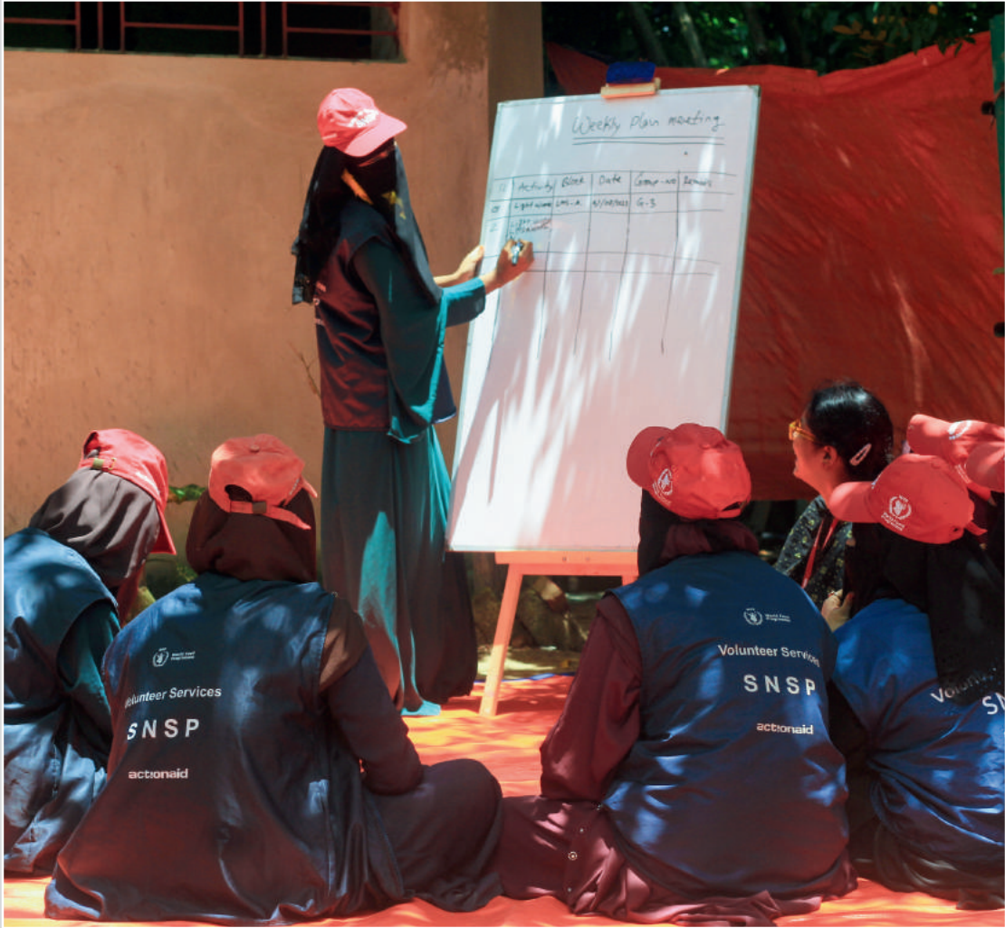
A project volunteer is conducting a mentorship session