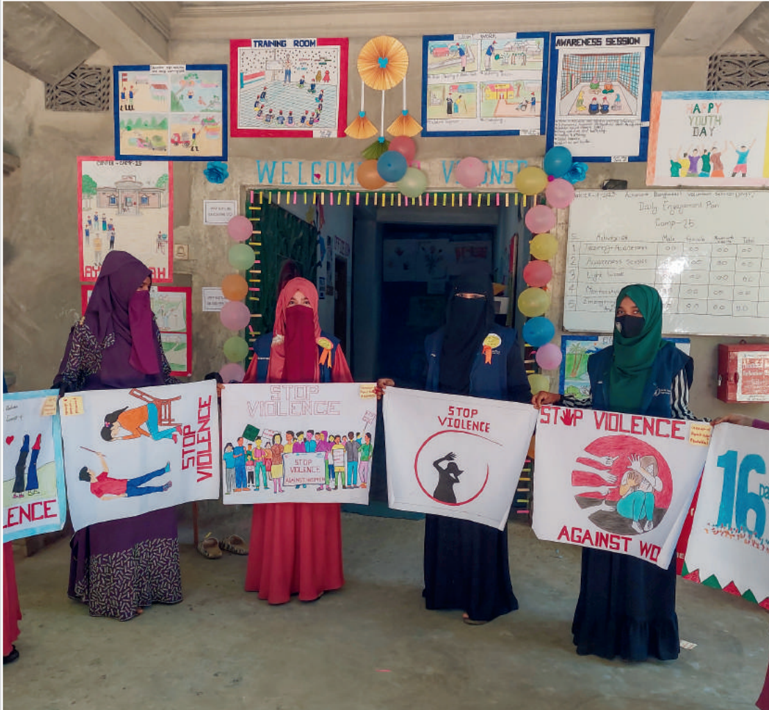
16 Days of Activism event to prevent violence against women in the camp by increasing awareness