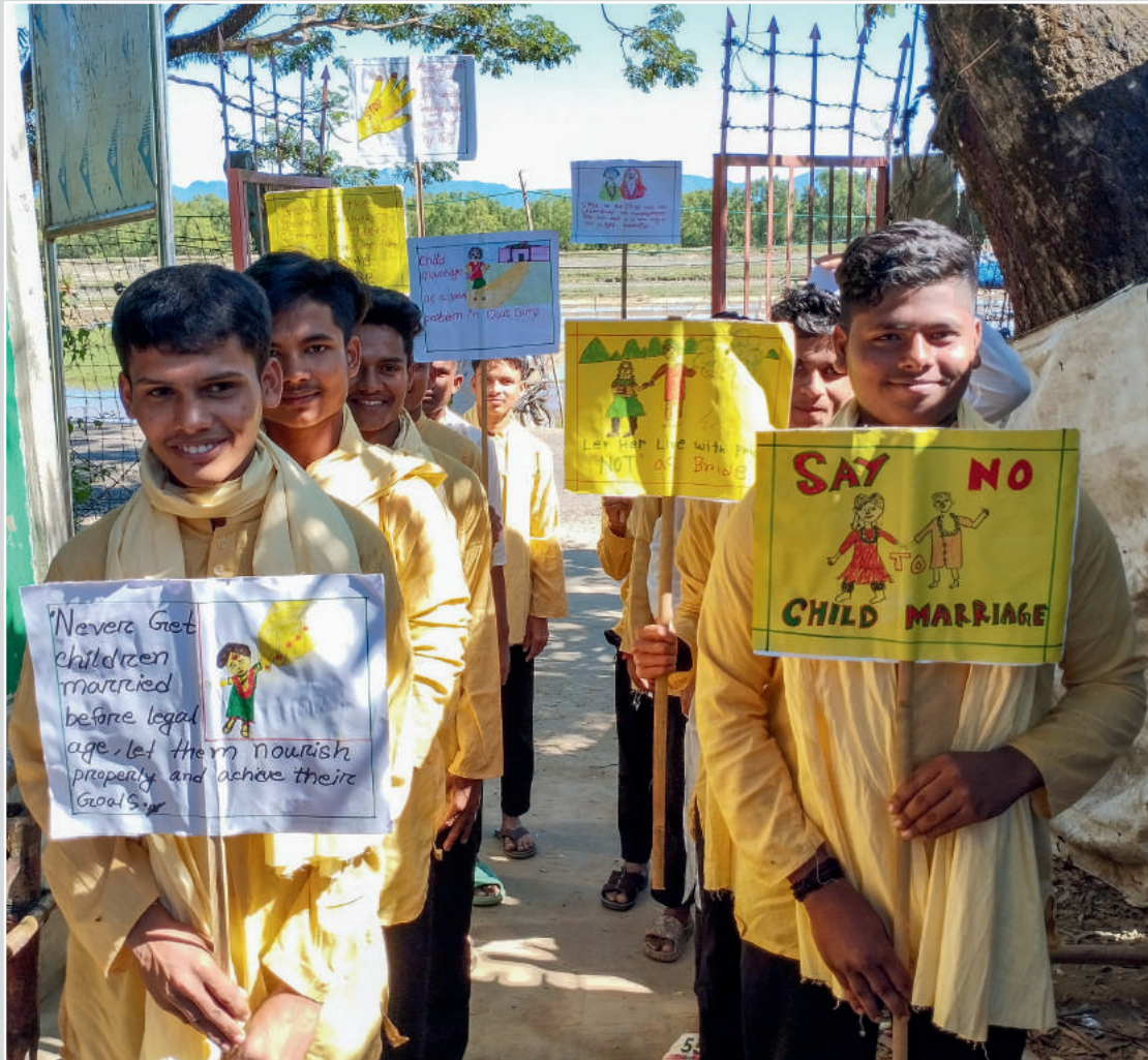
16 Days of Activism event to prevent violence against women in the camp by increasing awareness