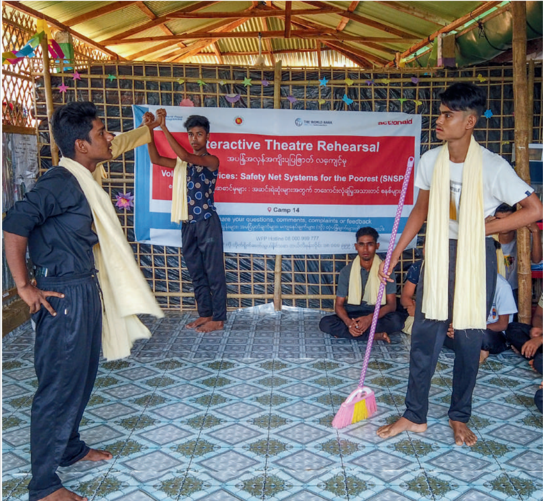
Project volunteers rehearsing for an interactive theatre performance