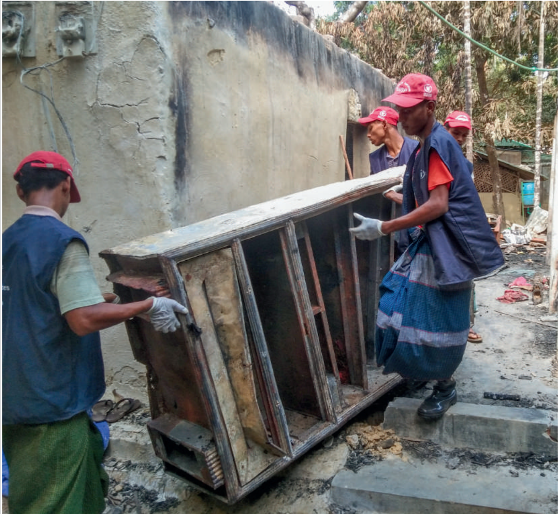
Volunteers from the project participated in fire response activities