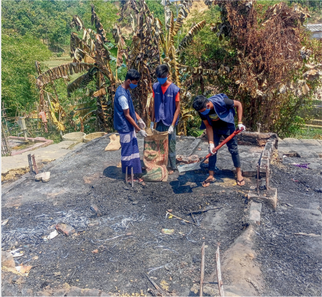
Volunteers from the project participated in fire response activities