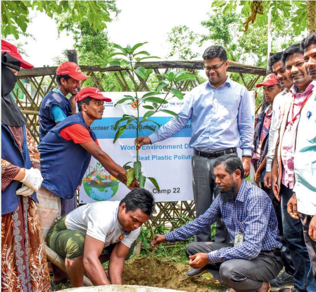
Observing World Environment Day through tree plantation