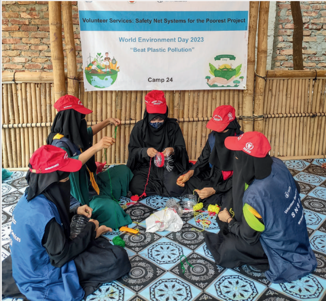
Project volunteers celebrated World Environment Day in 2023