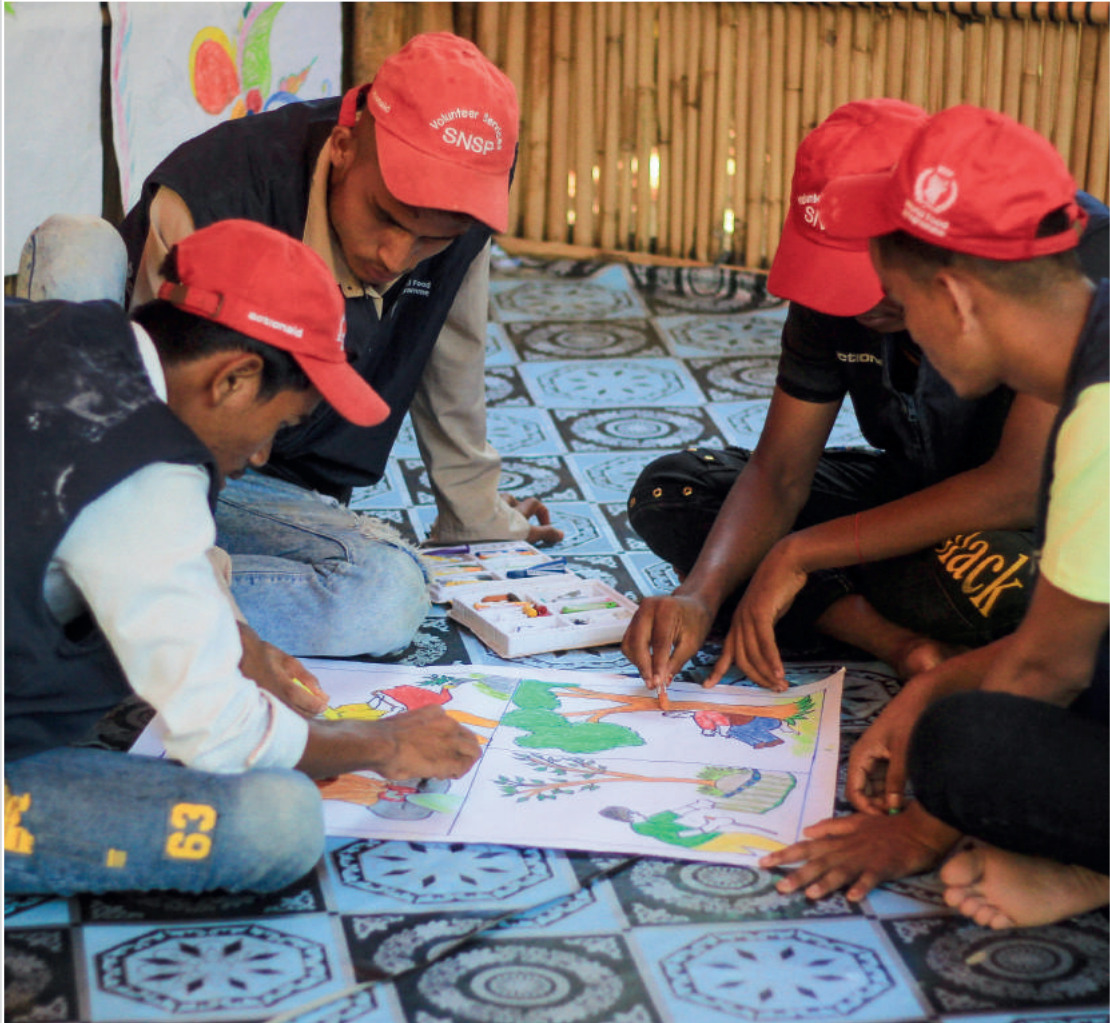
Volunteers from the VS-SNSP Project engaged in painting activities