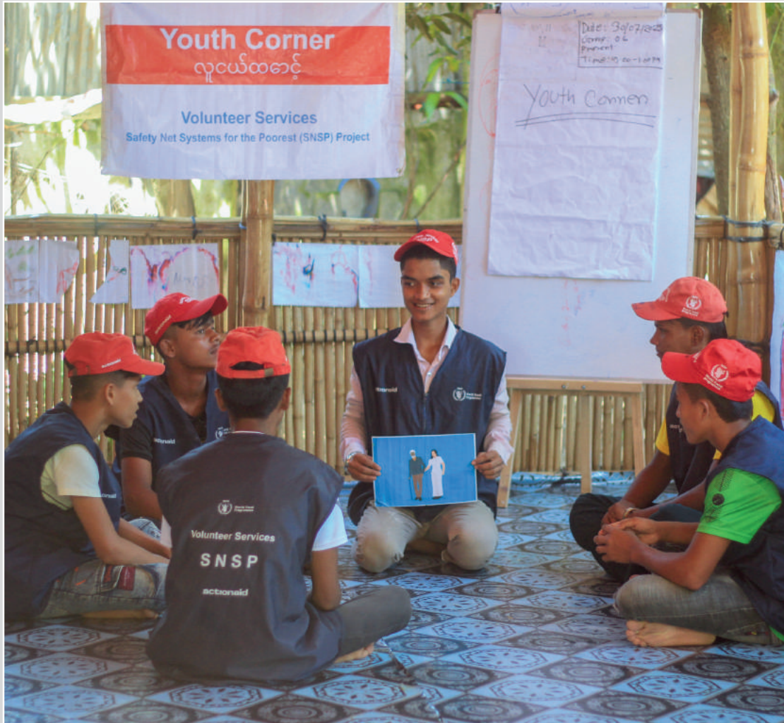
Volunteers engaging in a peer learning session